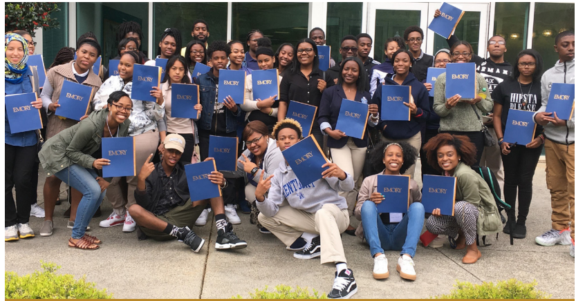
Cedar Grove High School students try out Emory for a day

Walker’s students plan it all: the tour groupings, what the large group experiences are going to be, what the individual experiences are going to be. Everything is tailored to individual student needs.