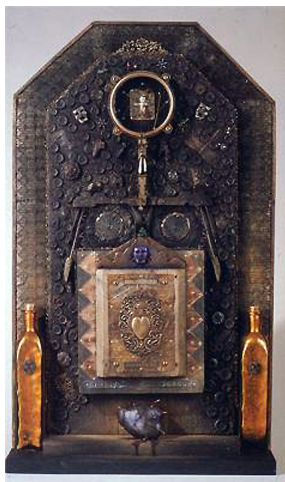
Icon of Love by Renee Stout

Code switching. On its face, the term might suggest hints of government intrigue, but it is actually the reverse.