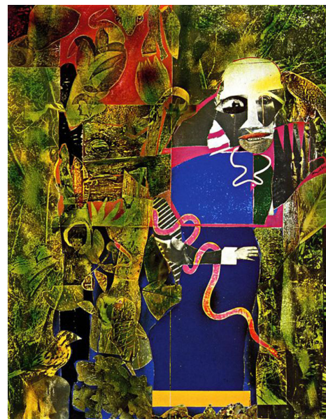
Conjure by Romare Bearden